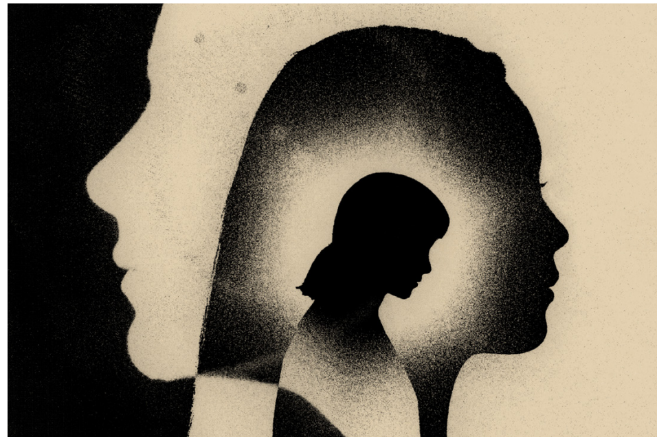
ILLUSTRATION BY VARTIKA SHARMA FOR THE WASHINGTON POST

correctly, which Aija usually couldn't manage — but there was also something about Aija's expression in that moment.